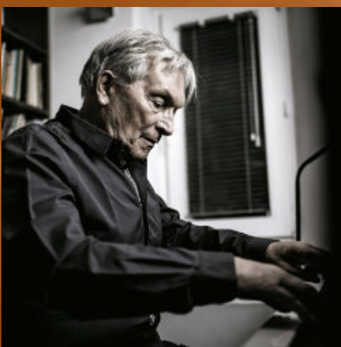
Artistic Director Zygmunt Krauze