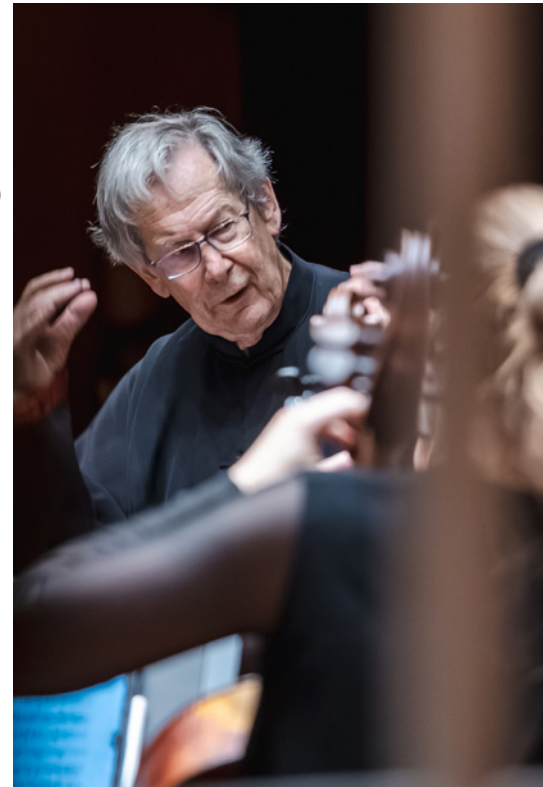
Sir John Eliot Gardiner 2024

(pianist, lied-interpretation Mozarteum Salzburg)