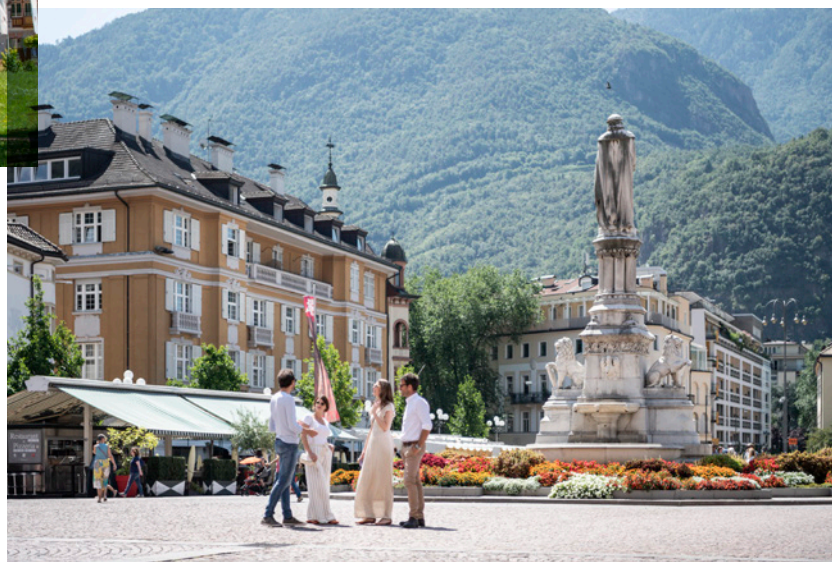
Bolzano – Bozen

“The Mahler Academy is an ingenious organisation for the promotion of young talents!” Die Welt