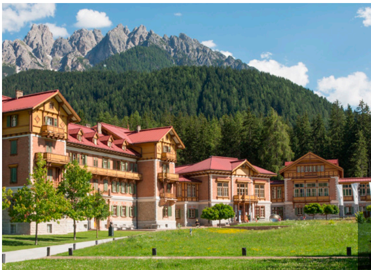
Dobbiaco – Toblach

“The Mahler Academy is an ingenious organisation for the promotion of young talents!” Die Welt