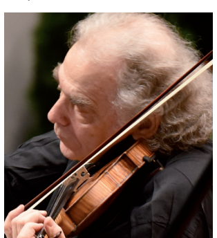
Zakhar Bron <sub>Violin</sub>