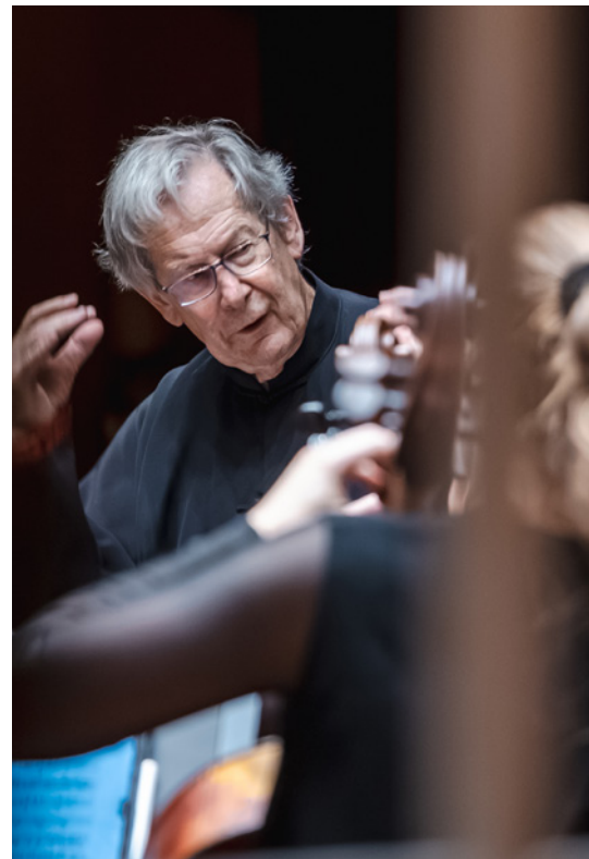
Sir John Eliot Gardiner 2024

(pianist, lied-interpretation Mozarteum Salzburg)