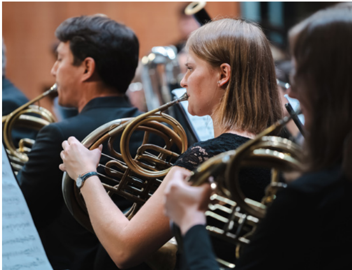
originalklang project 2024

The Academy continues with 50 students of the Mahler Academy and 50 members of outstanding European ensembles forming an orchestra, that has been highly acclaimed by audiences and critics and has caused a sensation during their hugely successful tour in 2024. Playing on period instruments from around 1900, provided by our partner Euregio Kulturzentrum Toblach, the orchestra reconstructs the sound and style of early Viennese modernism and brings a new and revolutionary sound to the Music of Mahler and his contemporaries. No prior period-instrument-experience required!