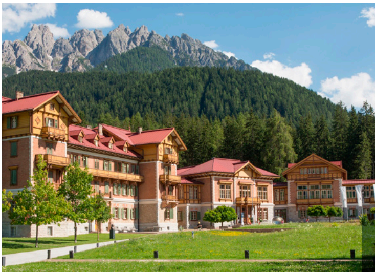
Dobbiaco – Toblach

“The Mahler Academy is an ingenious organisation for the promotion of young talents!” Die Welt