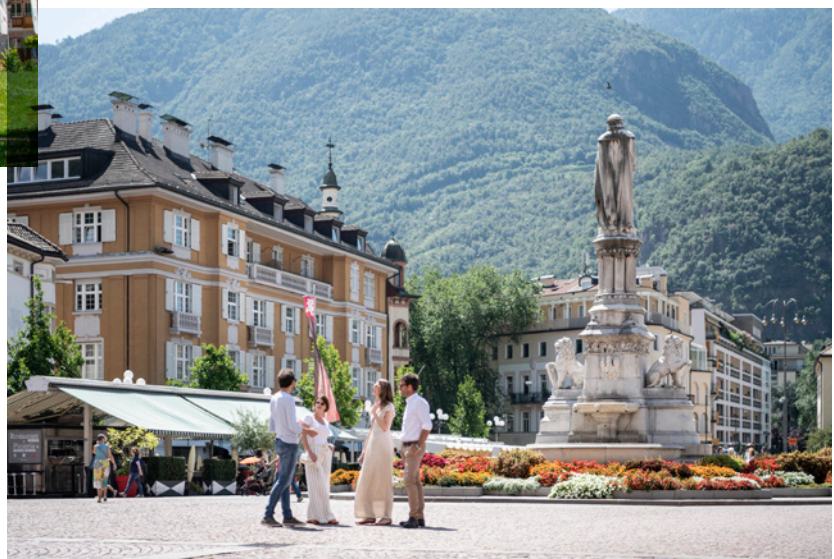
Bolzano – Bozen

“The Mahler Academy is an ingenious organisation for the promotion of young talents!” Die Welt