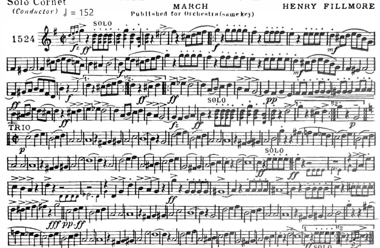
Copyright 1929 by The Fillmore Bros. Co., Cincinnati, Ohio. International Copyright Secured Printed in the U.S.A.