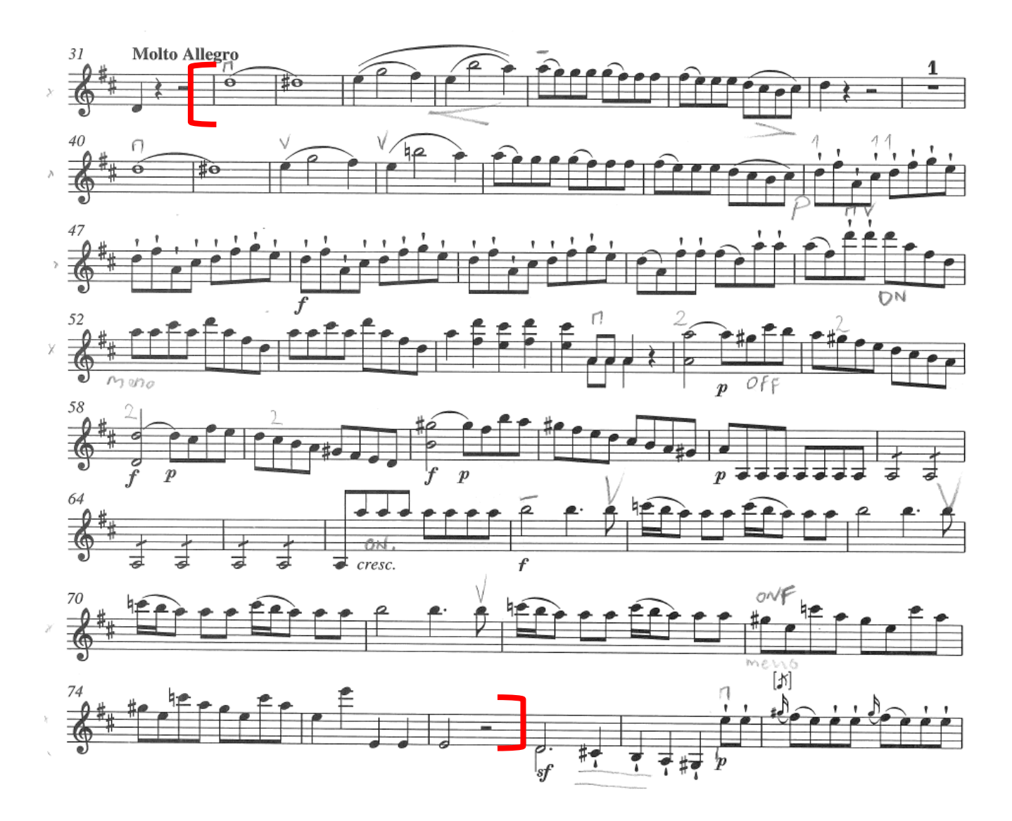
Shostakovich – Symphony No. 5